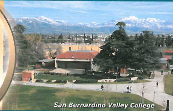
San Bernardino Valley College