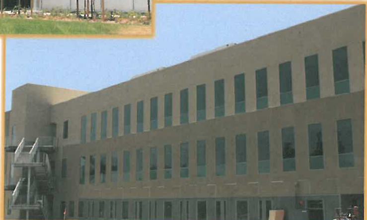
North Hall – Opened 2010